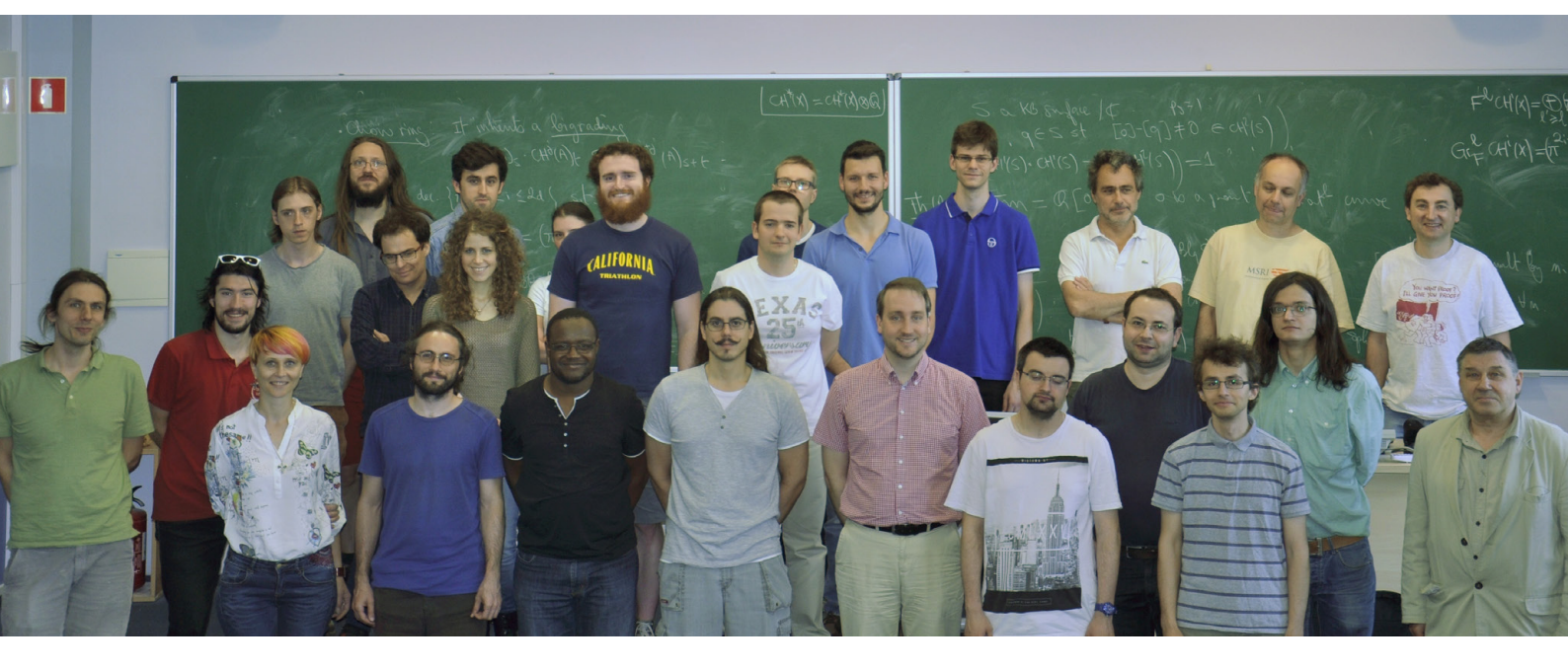
Participants of the Simons Semester "Algebraic Geometry"