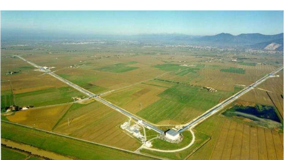
Virgo gravitational wave detector. Cascina near Pisa, Tuscany, Italy.

On the 11th of February 2016 the LIGO-Virgo Consortium announced the first direct detection of a gravitational wave signal. The publication describing this discovery was signed by 1005 authors - members of the Consortium. It included 9 authors form the Virgo-POLGRAW group. Those 9 authors were awarded the Copernicus Medal by Polish Academy of Sciences. All the 1005 authors of the discovery paper (including 9 members of the POLGRAW group) were awarded the Special Breakthrough Prize, USA.