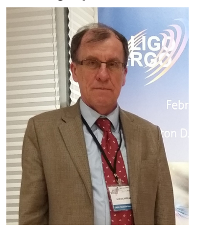
Andrzej Królak - leader of the POLGRAW group at the press conference announcing the first direct detection of a gravitational wave signal held at Cascina, Italy, 11th February 2016.

The group contributes to the following data analysis